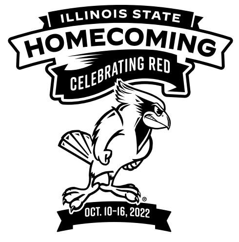
For more information, visit Homecoming.IllinoisState.edu